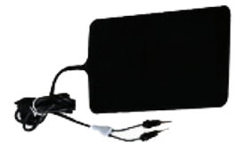
Silicon Patient Plate (Optional)